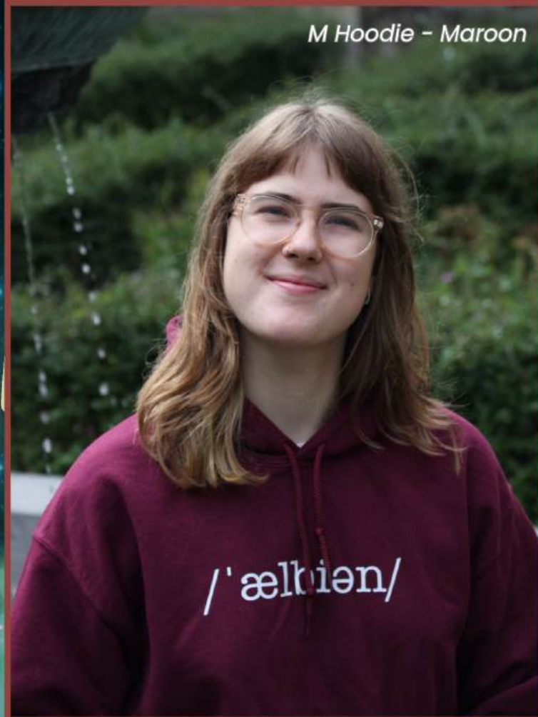
M Hoodie - Maroon