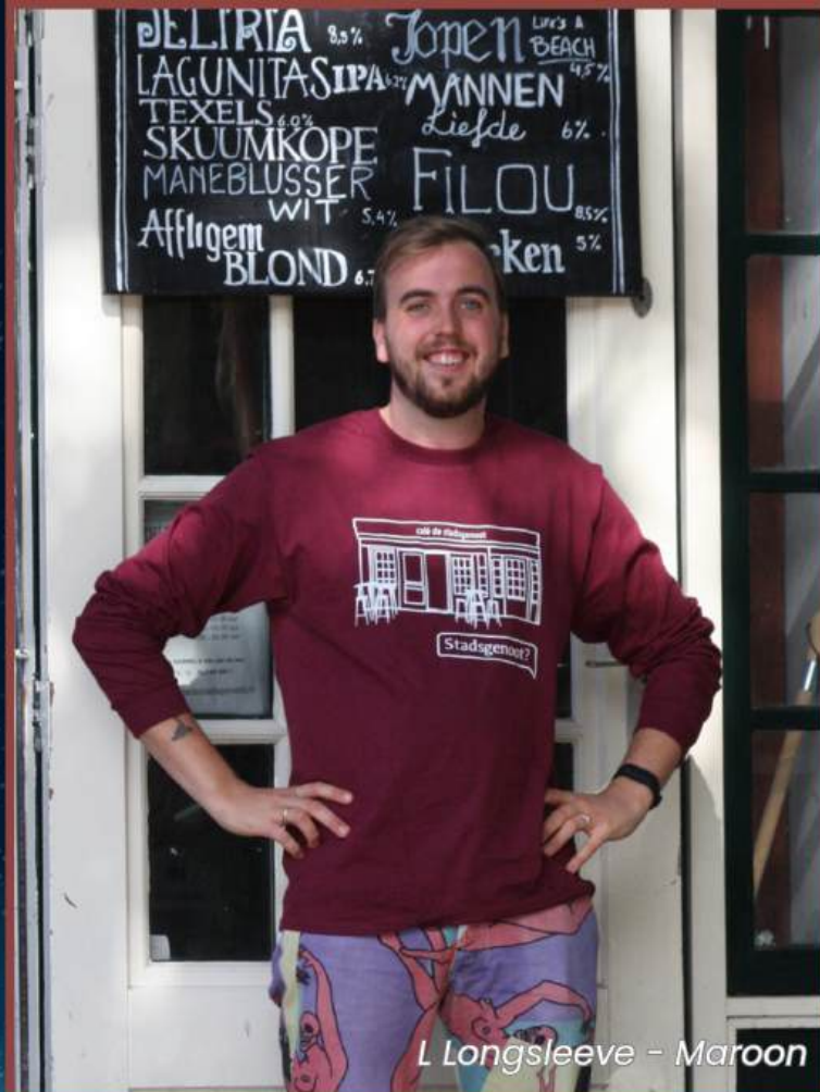
L Longsleeve - Maroon

What is an Albion activity without the age old question: Stadsgenoot? So what is a lustrum merch magazine without Stadsgenoot? Join the crew and show your support for the greatest place in Utrecht!