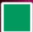
Antique Irish Green