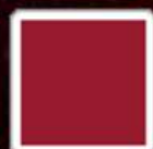
Antique Cherry Red