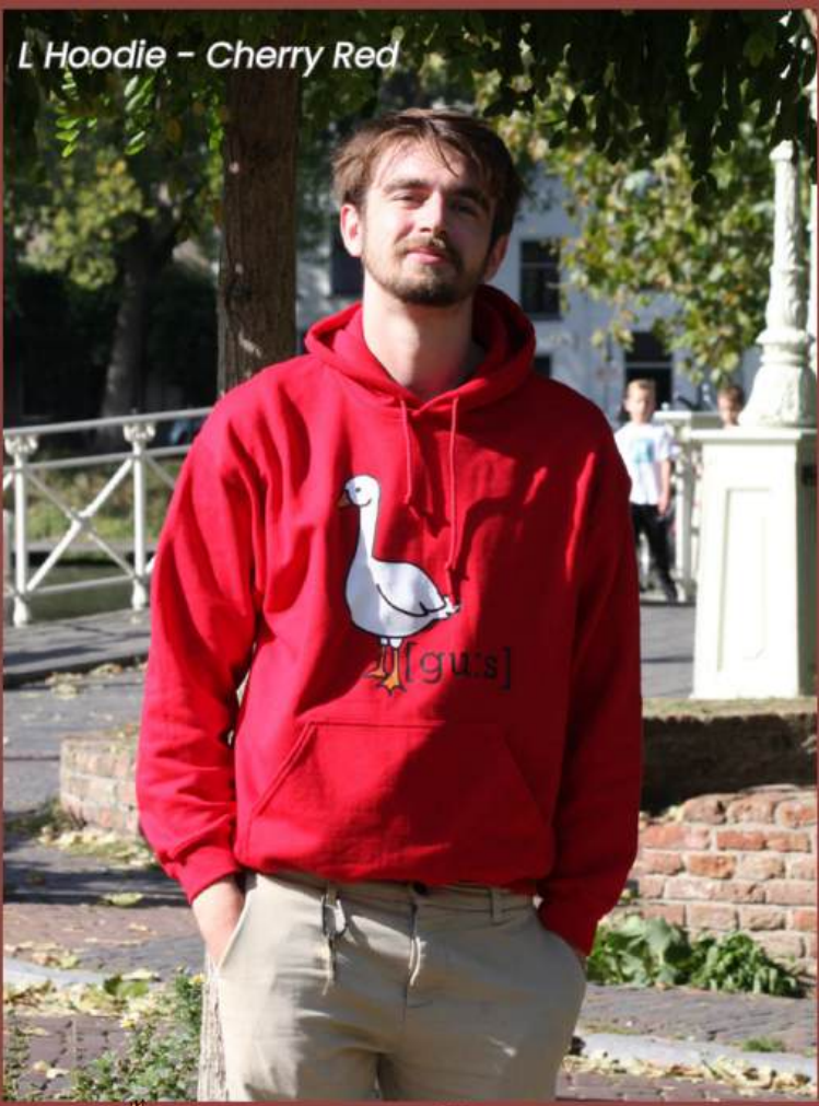
L Hoodie – Cherry Red