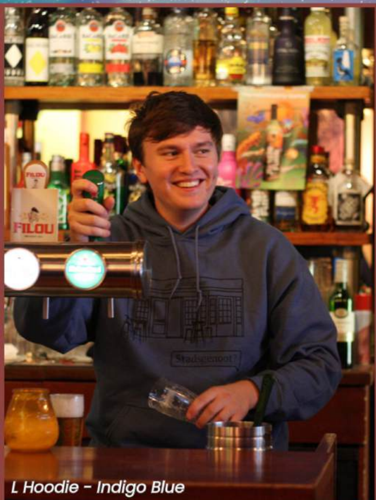
L Hoodie - Indigo Blue