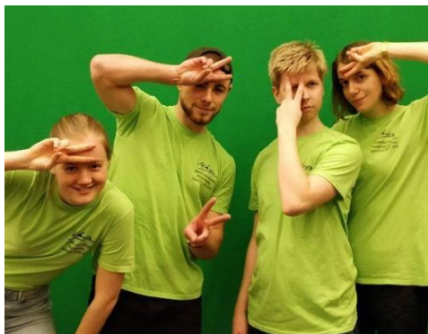
Sports Committee 2018-2019

Albion would be lost if there were no committees to organise every splendid event. Every full member of Albion is allowed to join a committee, so even as a first year you can be a part of Albion's organisation. It is even very much encouraged! Committees are besides a very fun preoccupation, really informative. You get to learn what it takes to organise events like a symposium or a one-week trip abroad for a number of people. So, getting involved can also be a boost on your own organising skills. There is a great diversity in committees you might join, varying from the Academic Committee to the Big Trip Committee to the Party Committee. You can find more detailed info them on our website.