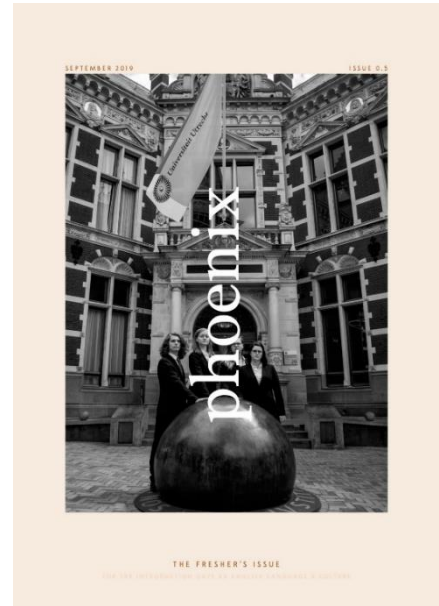
Phoenix' Fresher's Issue 2019-2020

However, you get to learn all your fellow first-year students during the introduction days in the first week. Every degree has to organise an orientation day on Monday and Albion always makes it very entertaining. You will also get to know all there is to know about university to survive the first few days. During the rest of the week there will be activities organised for first years, so you can join them if you feel like it!