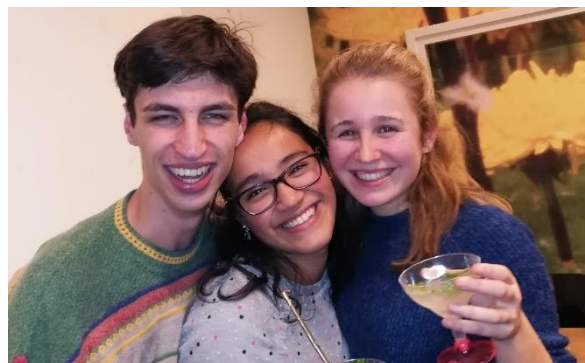
Albioneers at the Cocktail Workshop

Besides our study related events, there are also plenty of social activities. Hosted by various committees, they will make sure there's always an activity you will enjoy. Some of the best activities there have been so far include lasergaming, a cocktail workshop, an archery workshop, a fall hike, pub lectures, an escape room and many more! Albion also has its own Monthly Drinks, where you can catch up with fellow Albioneers with a cold beer or some Iced Tea in your hand.