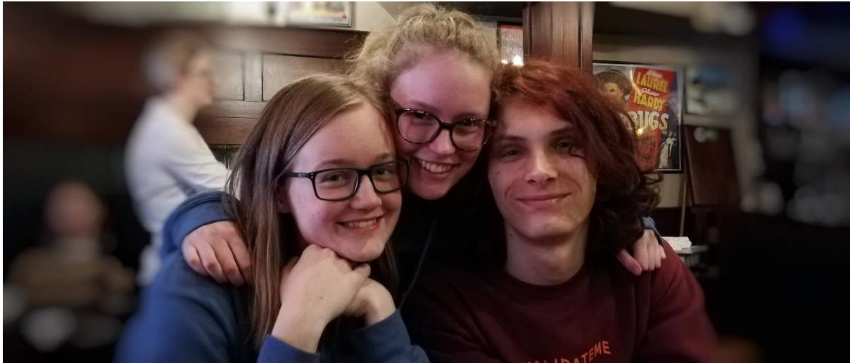
Big Trip to Dublin, April 2019